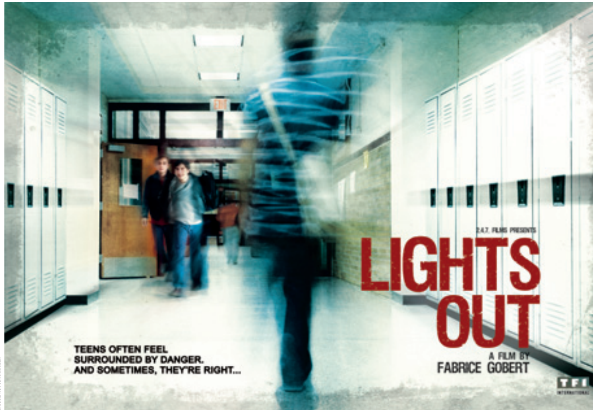
Credits not contractual.