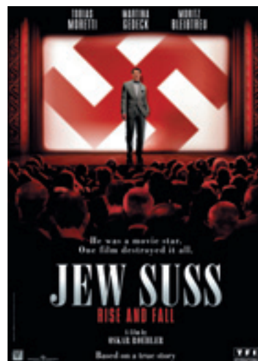
Credits not contractual.

A heart-wrenching story about the seductiveness - and price - of evil.